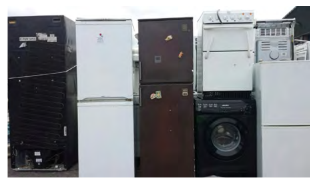
Consolidated white goods

The collection of white goods on the same contract resulted in the vast majority of items being collected within a mixed load, leading to in sub-optimal processing and redeployment of goods where feasible. Again, in consultation with the client, we now provide a dedicated white goods collection service on a monthly basis. This has allowed us to drive operational efficiency, complete inspections of items to determine those suitable for re-use/redeployment through charity partners, whilst delivering a cost saving of 7% to our client.